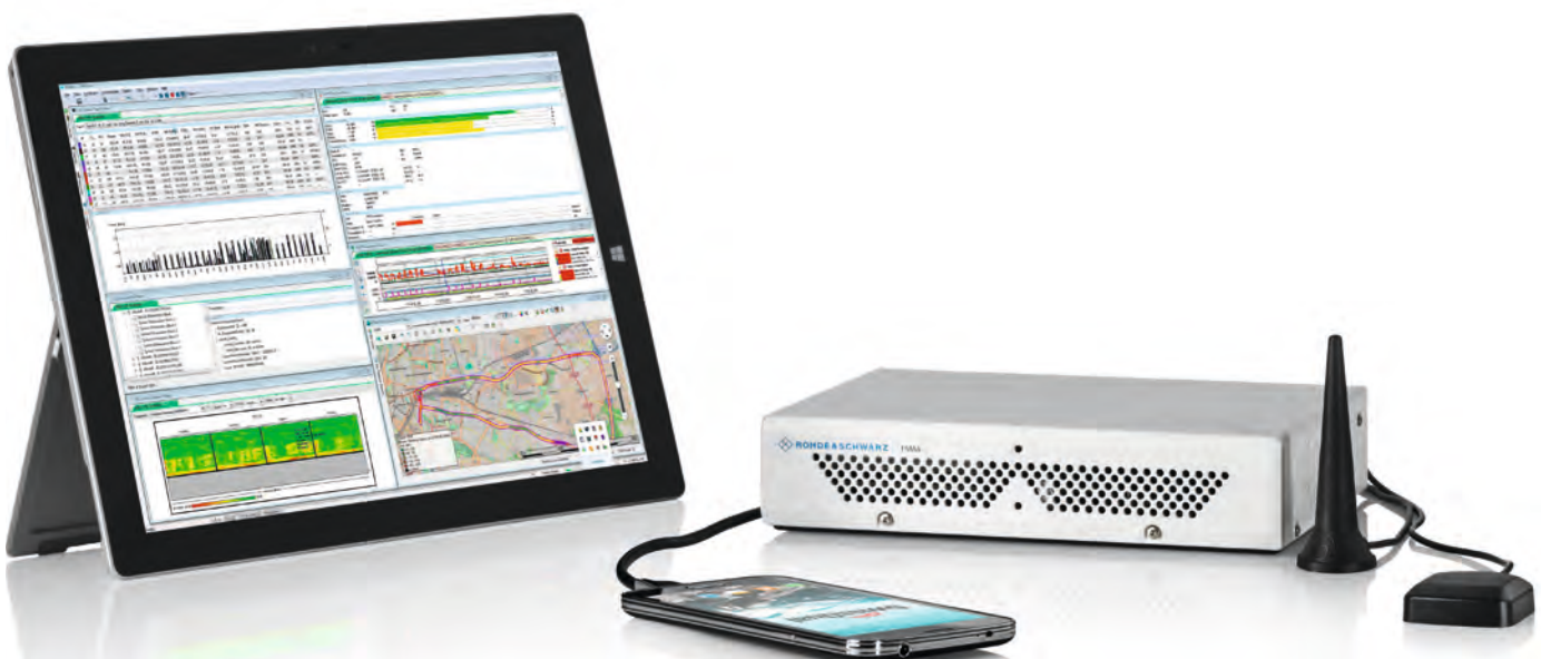
R&S®TSMA running R&S®ROMES4 for tests with scanner and test phone