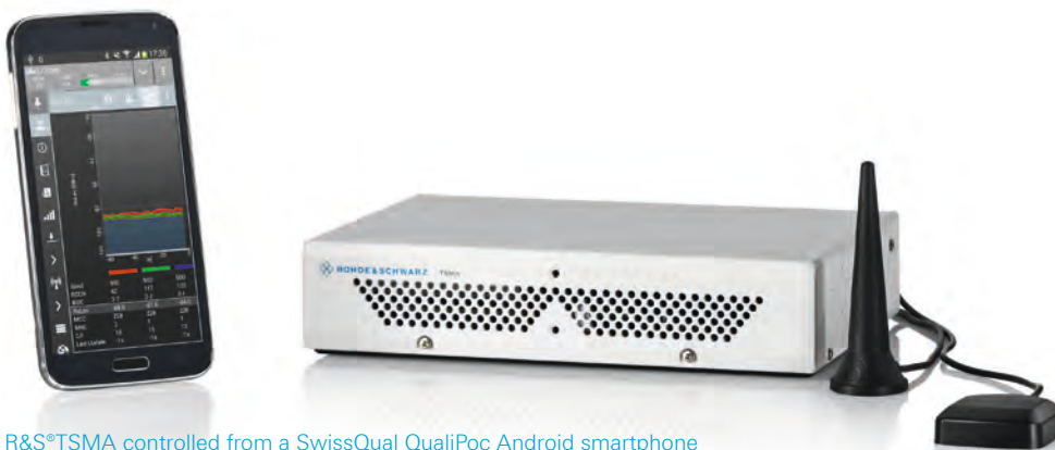
R&S®TSMA controlled from a SwissQual QualiPoc Android smartphone