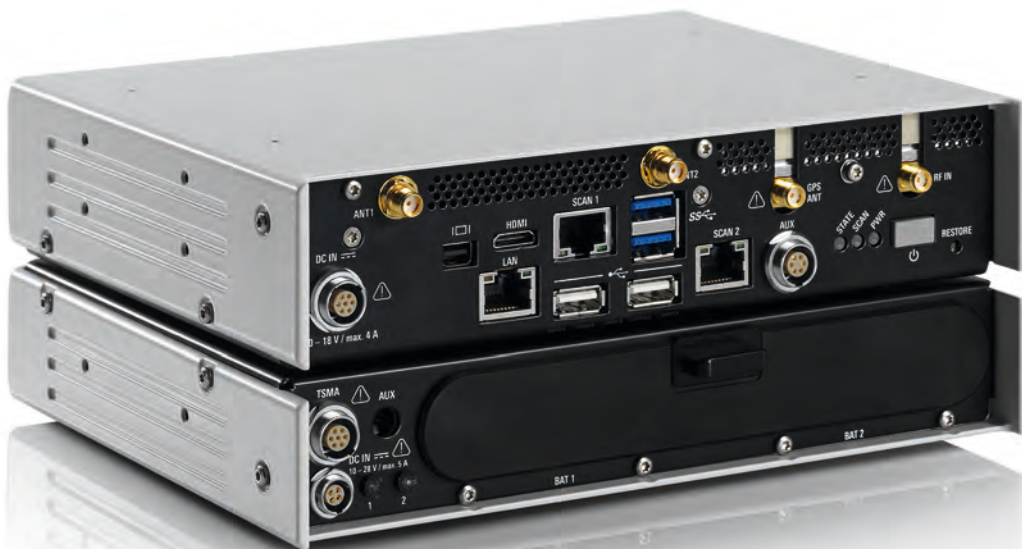
R&S®TSMA with R&S®TSMA-BP battery pack

The optional R&S®TSMA-ZCB2 carrying bag simplifies mobile scanner operation. The bag has room for the R&S®TSMA with battery pack, two spare batteries, a mobile phone, the R&S®TSME-Z7 antenna (frequency range: 700 MHz to 2.6 GHz) and an additional R&S®TSME for a MIMO setup. The battery pack is easily accessible, for fast replacement of batteries during operation.