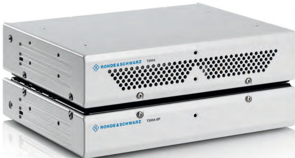
R&S®TSMA with R&S®TSMA-BP battery pack